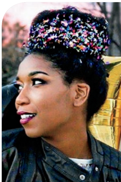
CONFETTI CROWN For a step-by-step guide on how to re-create this ideal New Year's Eve protective do, check out Naptural85 on YouTube.

“This confetti bun is for the girl who wants to bring the party, literally! It’s a fun style, and using added hair instead of your own protects it from the confetti!”