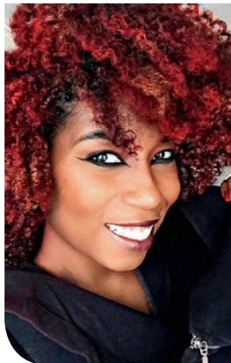
FIERY FRO "I sprayed a deep red temporary hair dye—which washes out—all over, followed by a blond temporary dye on various sections for dimension."