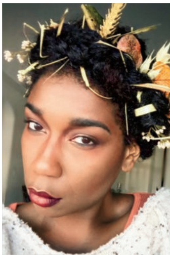
FLOWER POWER "This look was inspired by The Wiz . A simple crown braid is elevated by grabbing some seasonal flora and inserting them in various spots throughout the braid."