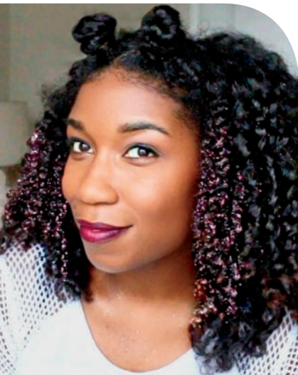
SHIMMERY ACCENTS "Just add some glitter gel to a few sections of your natural hair, prior to twisting, and when you unravel you'll have instant glitter highlights."

“This confetti bun is for the girl who wants to bring the party, literally! It’s a fun style, and using added hair instead of your own protects it from the confetti!”