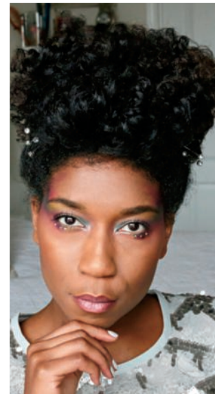
REGAL PUFF "From a basic rod set, gather curls on top of your head and pin in place. Your high puff just leveled up!"