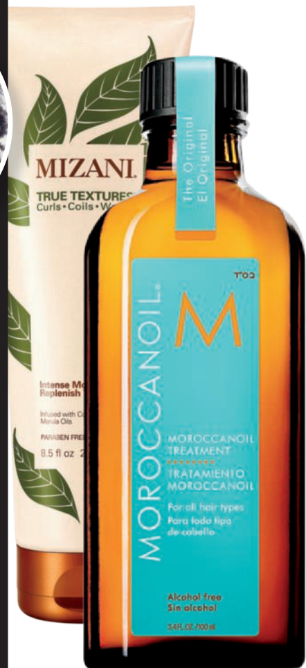
WOMAN: GLENFORD NUNEZ; PRODUCTS: COURTESY OF BRANDS.

MOROCCANOIL Treatment Original ($44, moroccanoil.com); MIZANI True Textures Intense Moisture Replenish Treatment ($18, Ulta). ▷