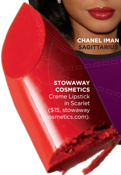
STOWAWAY COSMETICS Creme Lipstick in Scarlet ($15, stowawaycosmetics.com ).