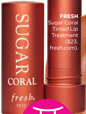
FRESH Sugar Coral Tinted Lip Treatment ($23, fresh.com).