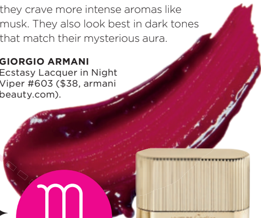
GIORGIO ARMANI Ecstasy Lacquer in Night Viper #603 ($38, armani.beauty.com ).

S corpions are potent and powerful, and this is very much a sign of transformation," says Ortelee. It's no surprise that they crave more intense aromas like musk. They also look best in dark tones that match their mysterious aura.