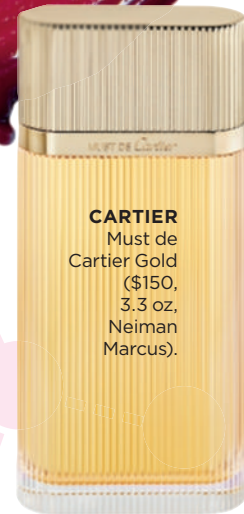
CARTIER Must de Cartier Gold ($150, 3.3 oz, Neiman Marcus).

“Scorpios are potent and powerful people and very much about transformation.”