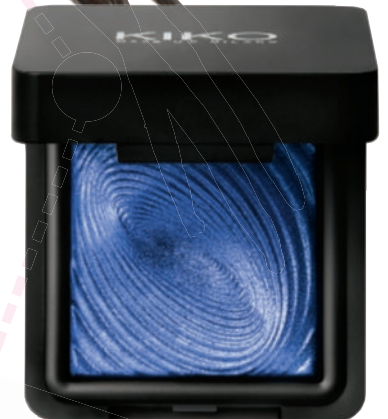
KIKO MILANO Water Eye Shadow in Indigo Blue ($14, kiko cosmetics.com).

B orn under the sign of the crab? Then you're likely to choose aquatic colors (blues and greens) that make you feel calm. Sensitive Cancers also have a keen sense of smell and like single notes like vanilla or peony.