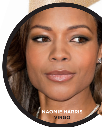
NAOMIE HARRIS VIRGO