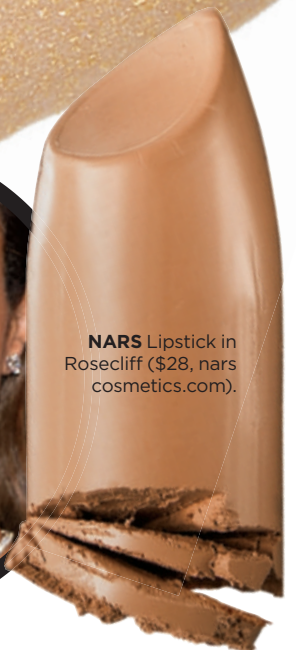
NARS Lipstick in Rosecliff ($28, nars cosmetics.com).