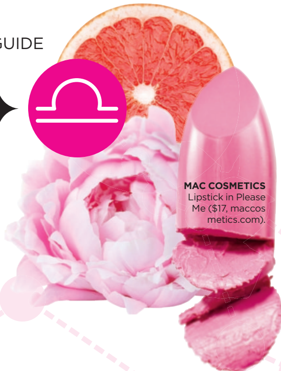
MAC COSMETICS Lipstick in Please Me ($17, maccosmetics.com ).