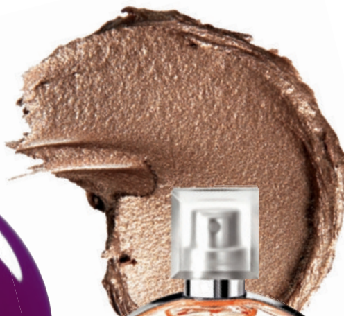
DEBORAH LIPPMANN Nail Lacquer in Miss Independent ($18, deborahlippmann.com ).