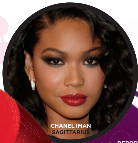
CHANEL IMAN SAGITTARIUS